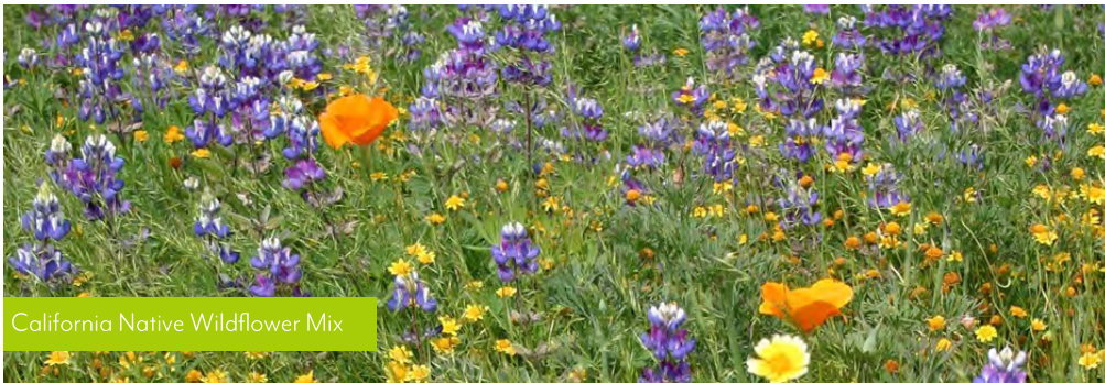
California Native Wildflower Mix

contain requirements to preserve topsoil. It is also important to select the right seed mix for the location. For some projects, California native mixes are the only species allowed – and these native mixes can be notoriously finicky to grow. They get easily choked out by invasive and noxious weeds, especially when the hydroseed is applied with a fertilizer. According to Jody, “natives tend not to respond to fertilizers, whereas weeds do. Applying fertilizer just promotes the competition.” In speaking of seed types, diversity is extremely important. In a field training event, the USDA Natural Resource Conservation Service demonstrated, using an excavated trench in a vegetated area, how plant diversity provides greater stability of the soil. Plants with deep tap roots provide vertical stability while plants with shallow spreading roots provide horizontal control. Caltrans also advocates for diversity stating, “in selecting plant material to control erosion, designers should try to maximize all potential environmental benefits of roadside planting. Because roadside planting is linear, adding pollinator friendly plants to the roadside can help restore transportation corridors for pollinators and other wildlife. For example, adding pollinator friendly plants to roadside erosion control mixes could increase the pollinator population in California by closing gaps in the corridors that connect butterfly breeding grounds